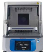
Solaris 2000 R Incubated and Refrigerated Shaker