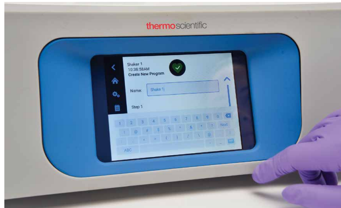
The large, bright user interface lets you easily monitor set points and status conditions from across the lab.

Solaris Orbital Shakers include a built-in orbital calculator that gives you the ability to convert protocols designed with different orbits and estimate the set speed needed to obtain similar results.