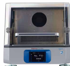
Solaris 4000 I Incubated Shaker